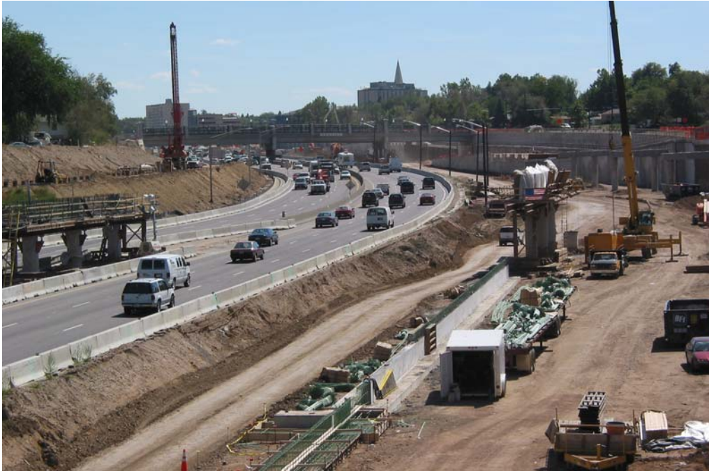
T-REX Construction Traffic Control; I-25 Narrows, South Denver

Overview: Urban and rural construction traffic control plans for freeways; arterial, collector and local streets—over 1,100 plan sheets