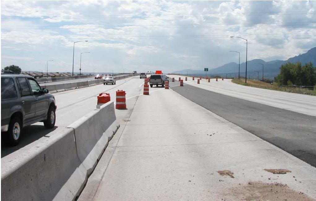
Goose Creek Project; Foothills Parkway (SH-157), Boulder